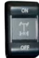
Standard differential lock

Available with manual gearbox or with NEES II. Available with mechanical suspensions with 3410mm wheelbase. Differential lock standard.